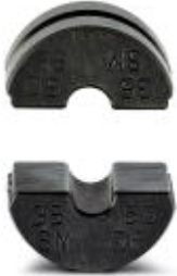
The figure shows the ...R35-50/DIE version

pre-round die (pair), for CRIMPFOX-C50, for sector cable 50 + 70 mm 2